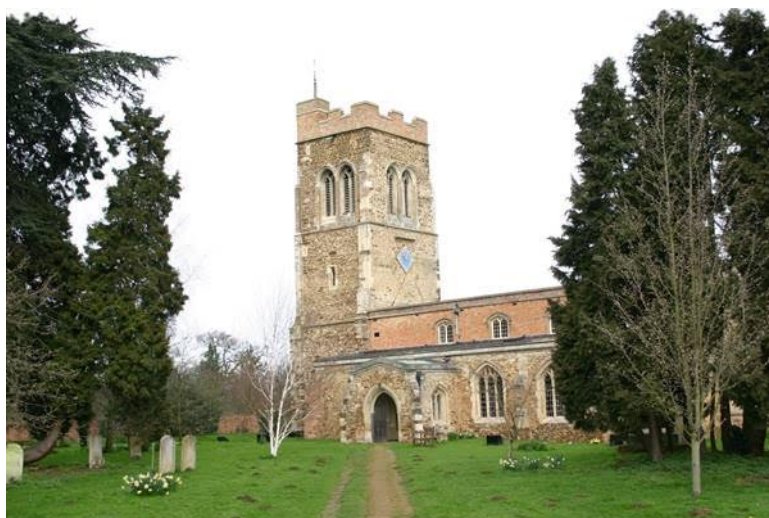
All Saints, Southill