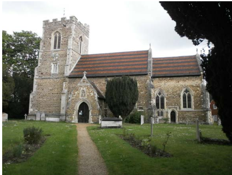
All Saints, Clifton